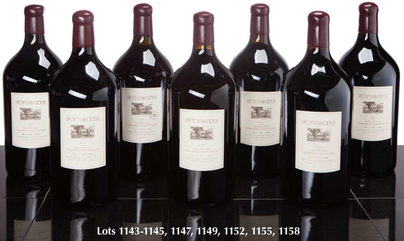
Lots 1143-1145, 1147, 1149, 1152, 1155, 1158