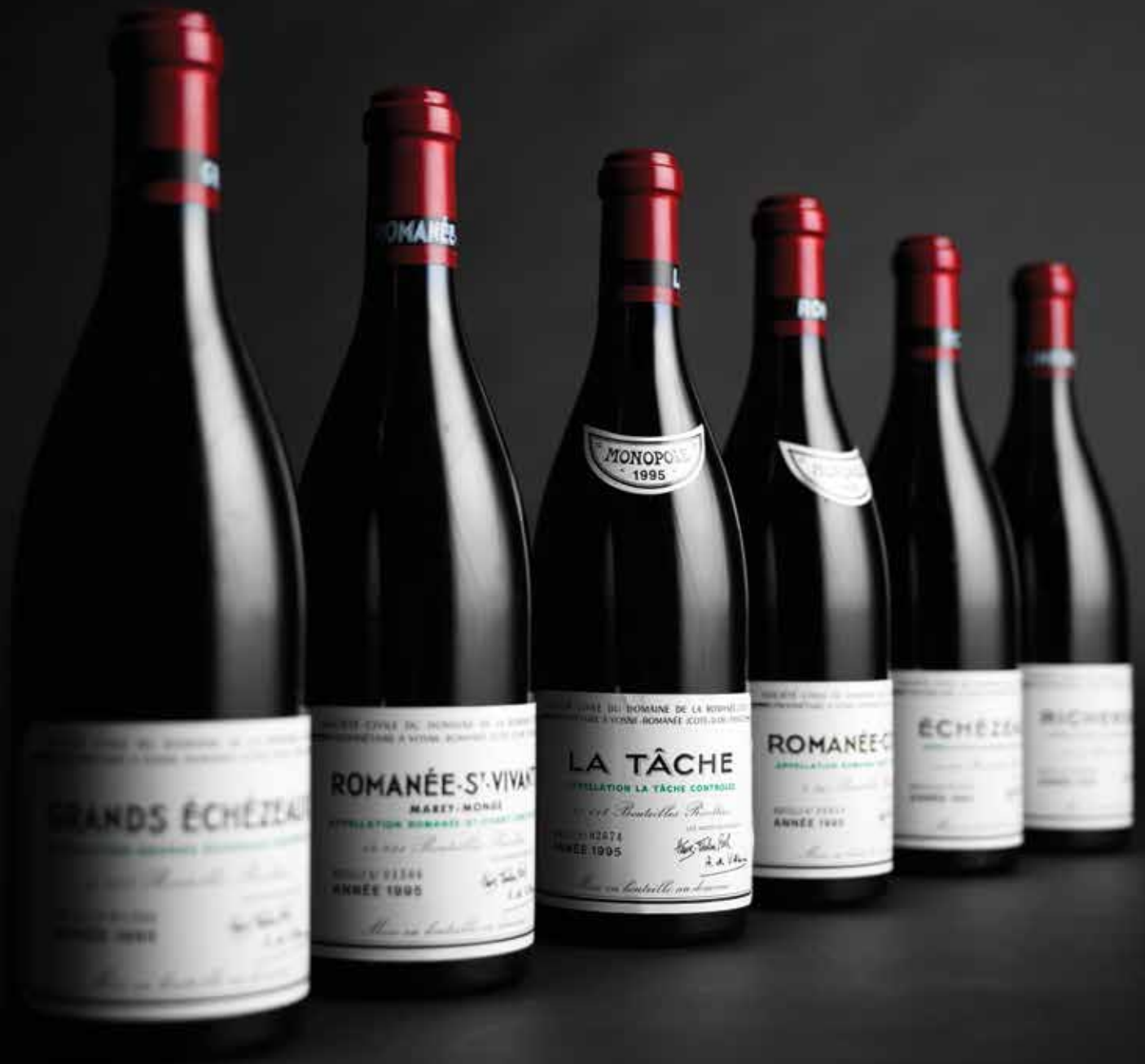
Lots 1369 & 1370