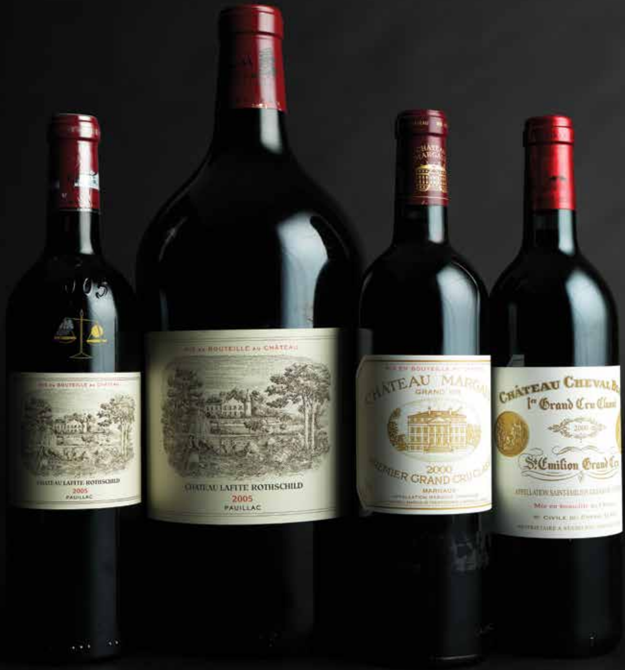
Lots 912, 913 & 918-920