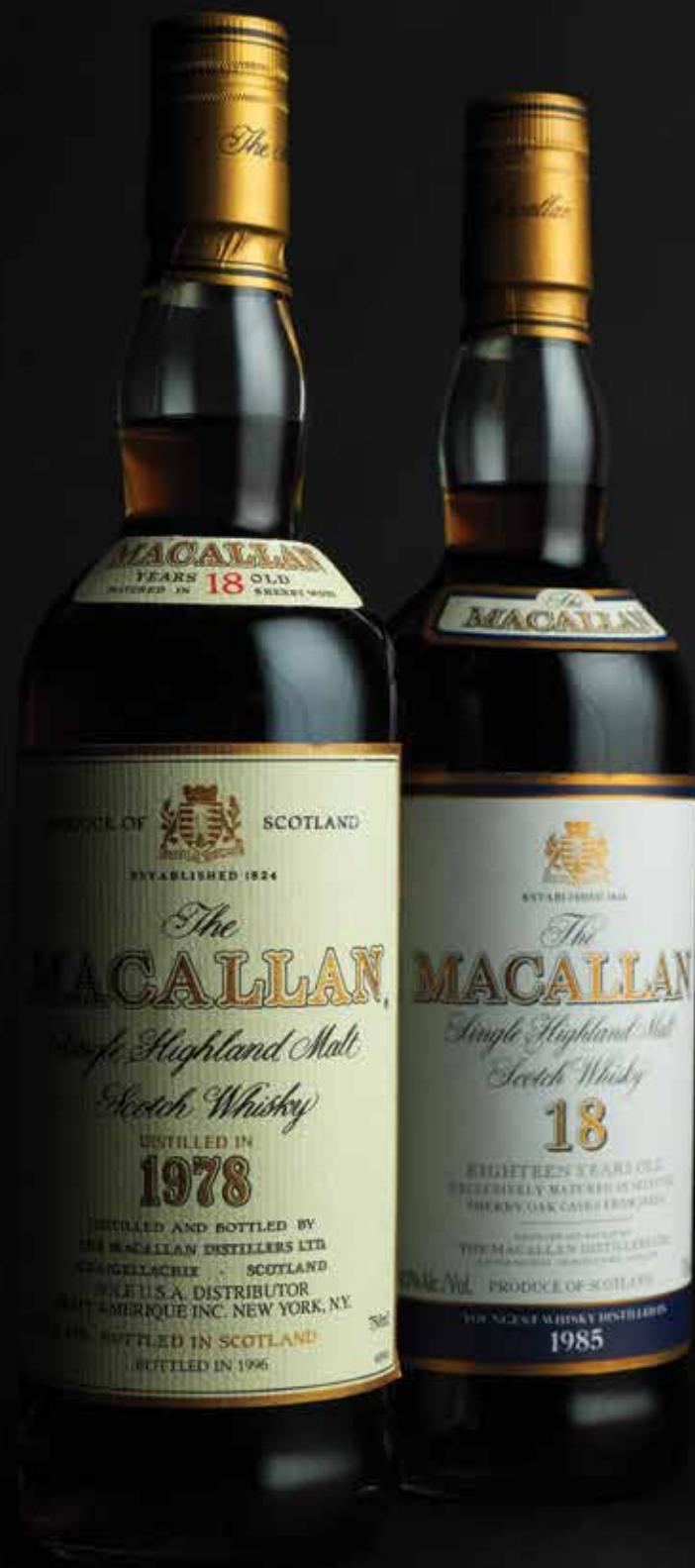
Lots 1720 & 1721