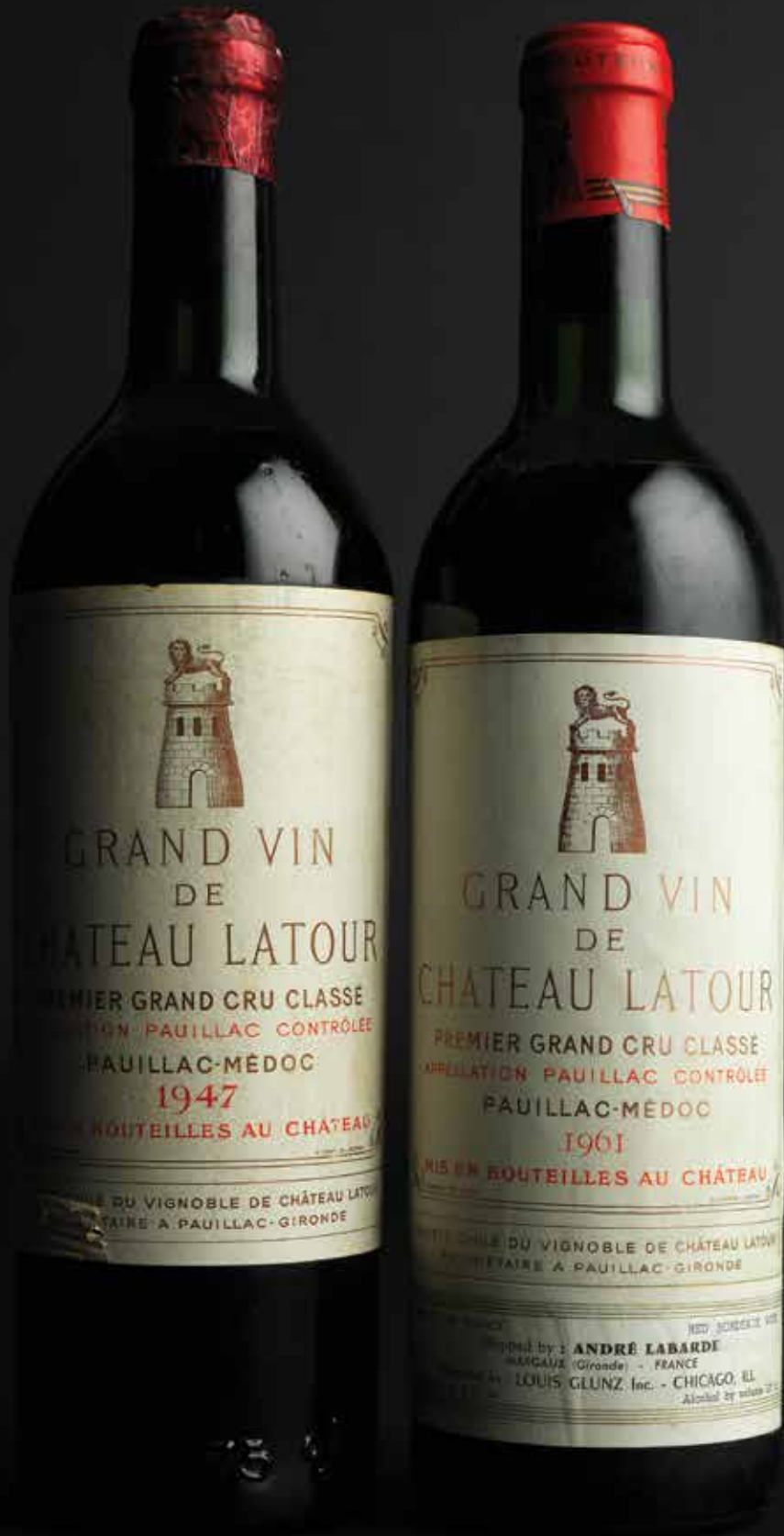
Lots 30, 33 & 34