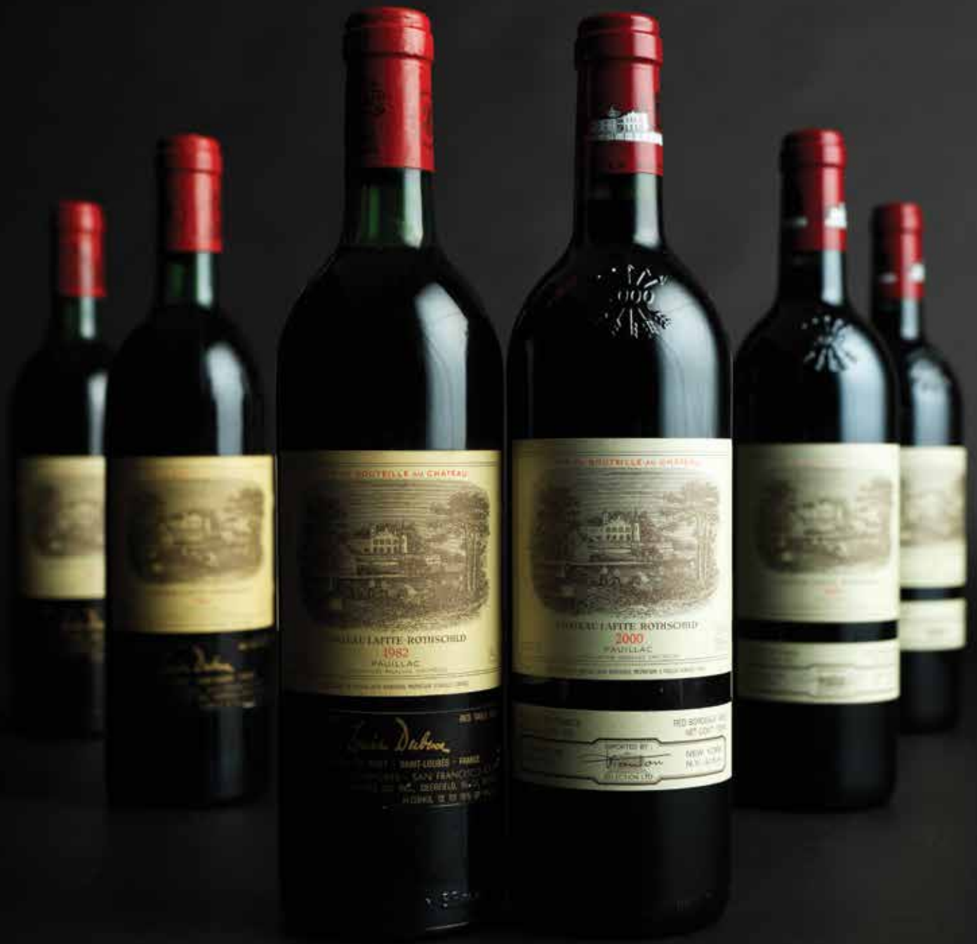
Lots 1099-1100 & 1103