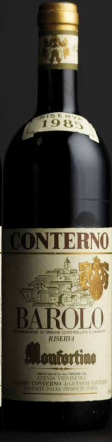
Lots 610 & 611