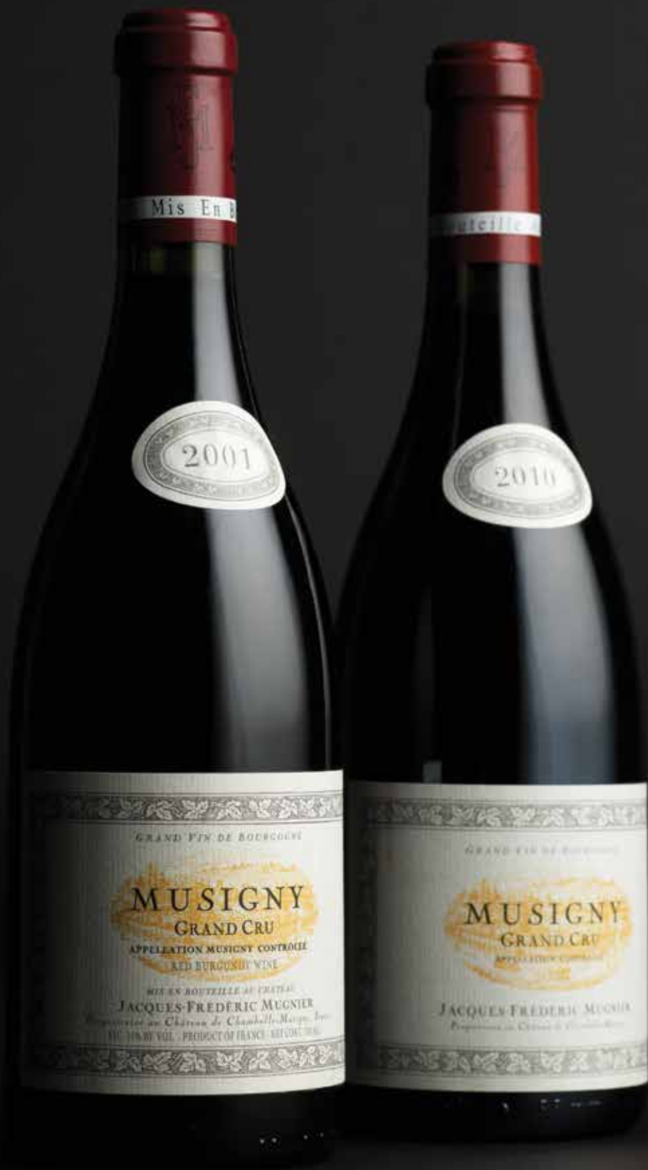
Lots 351 & 355