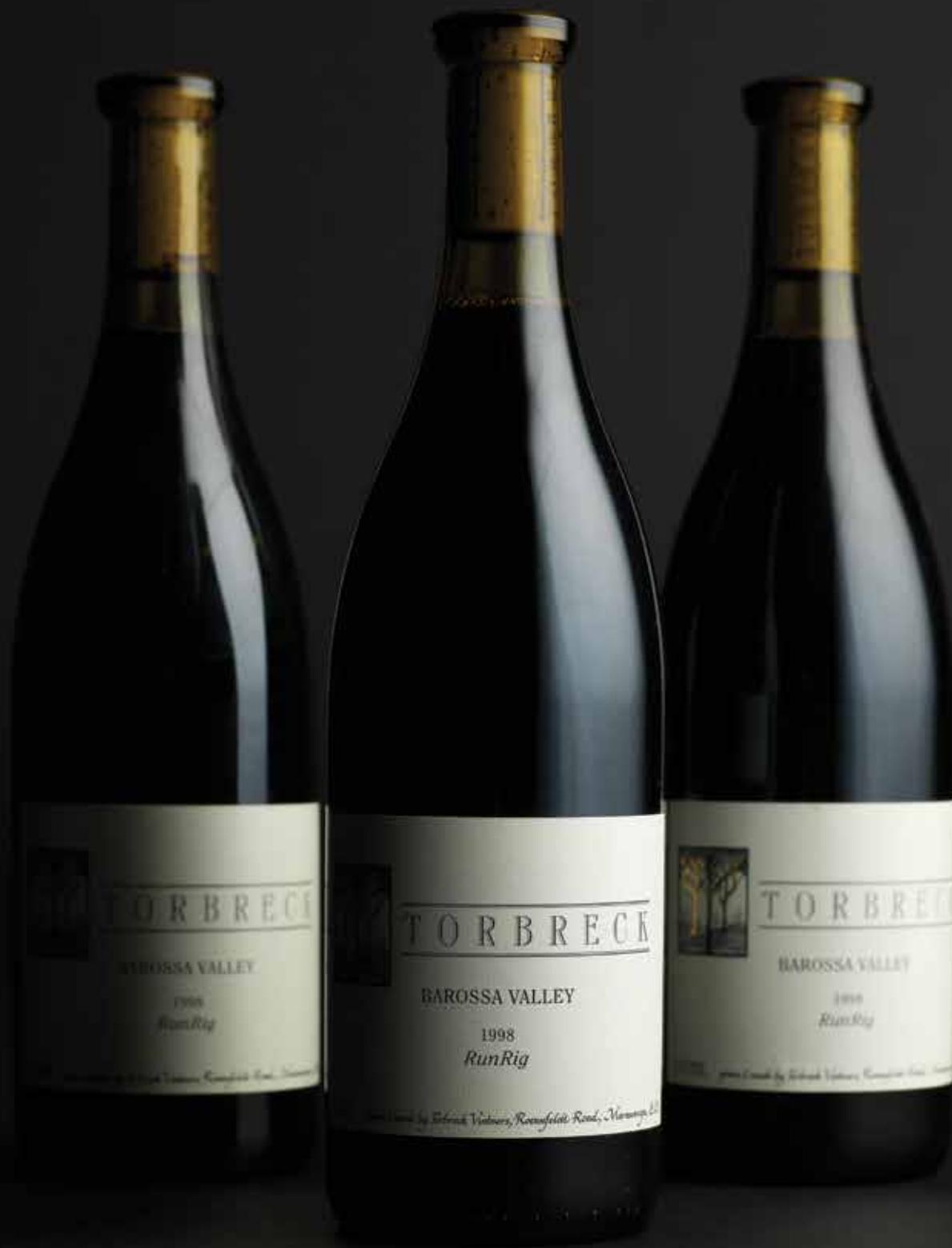
Lots 910 & 911