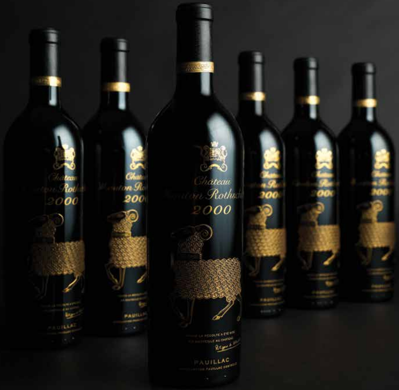
Lots 1173 & 1174