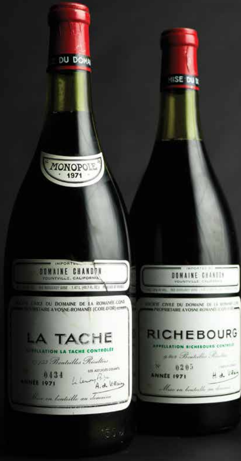
Lots 1401 & 1402