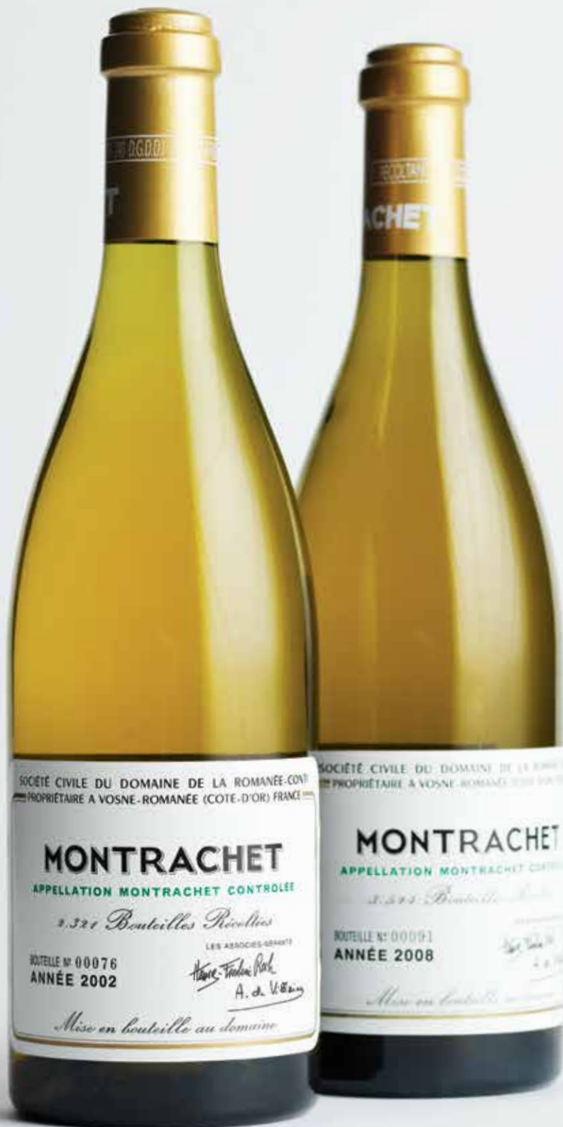
Lots 1375 & 1378