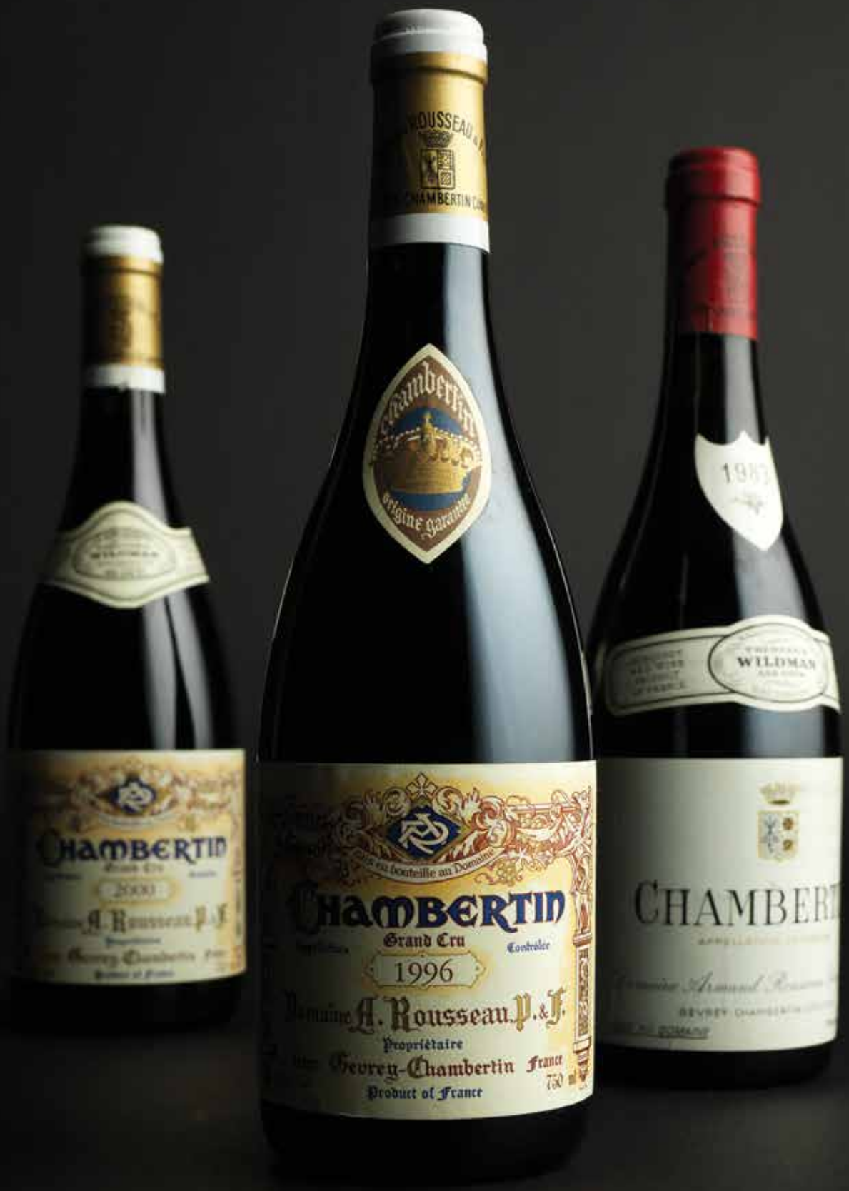
Lots 405, 406 & 408