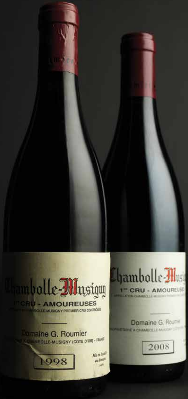
Lots 391 & 393