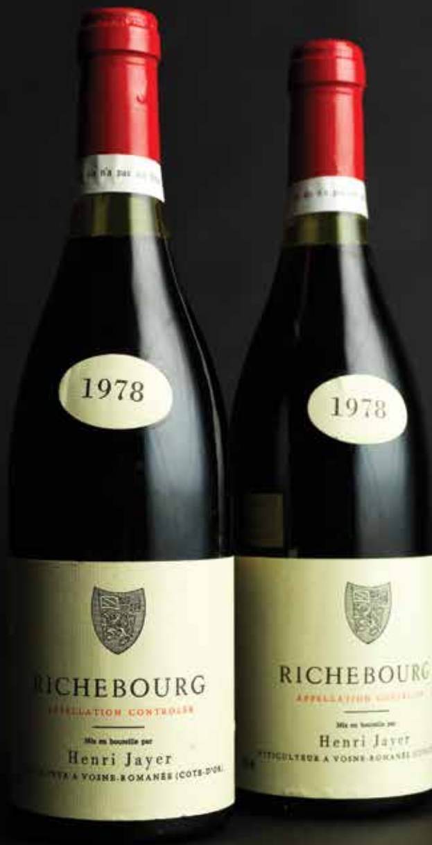
Lots 1404 & 1405

1408 3 magnums (1.5L) per lot US$22,000-32,000