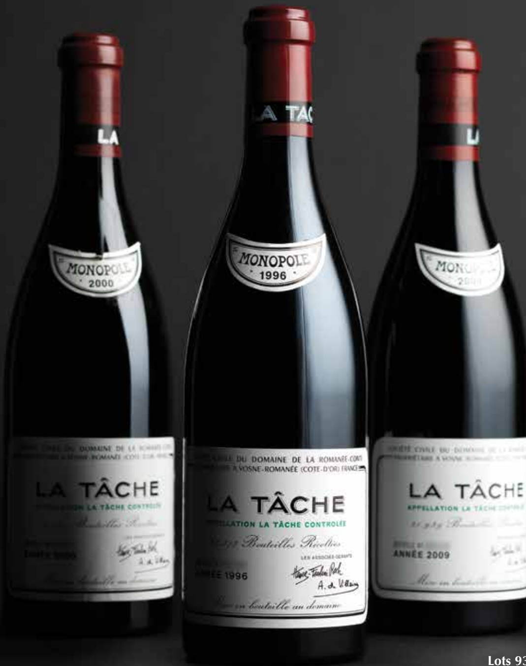
Lots 93, 95 & 98