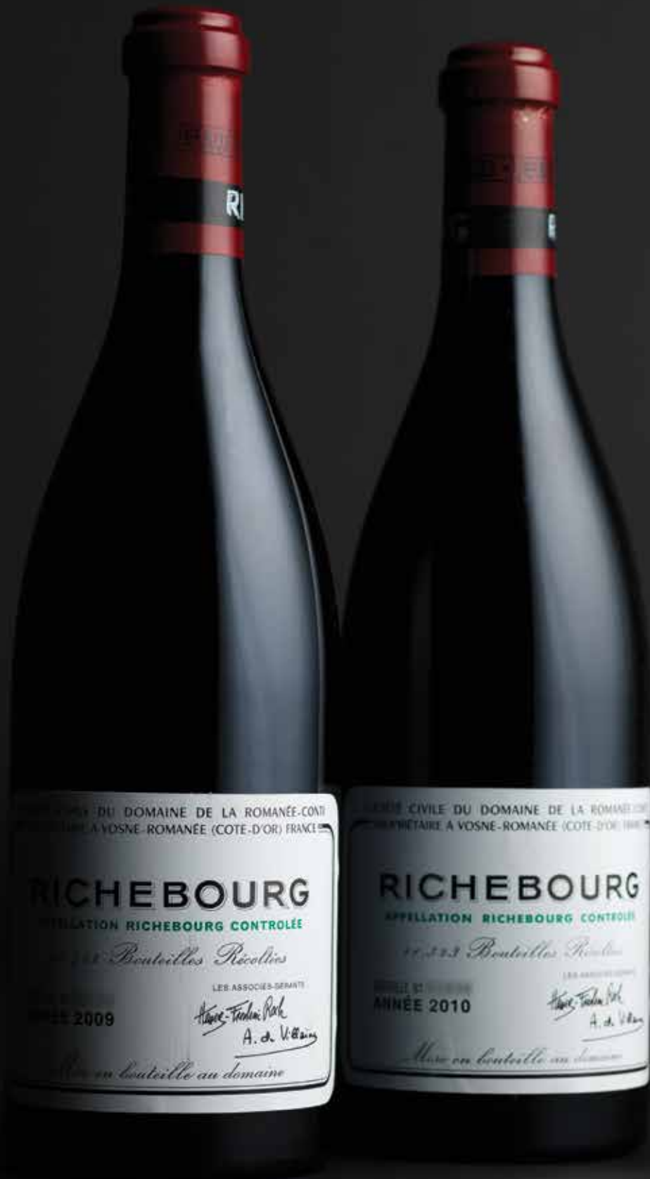
Lots 110 & 111