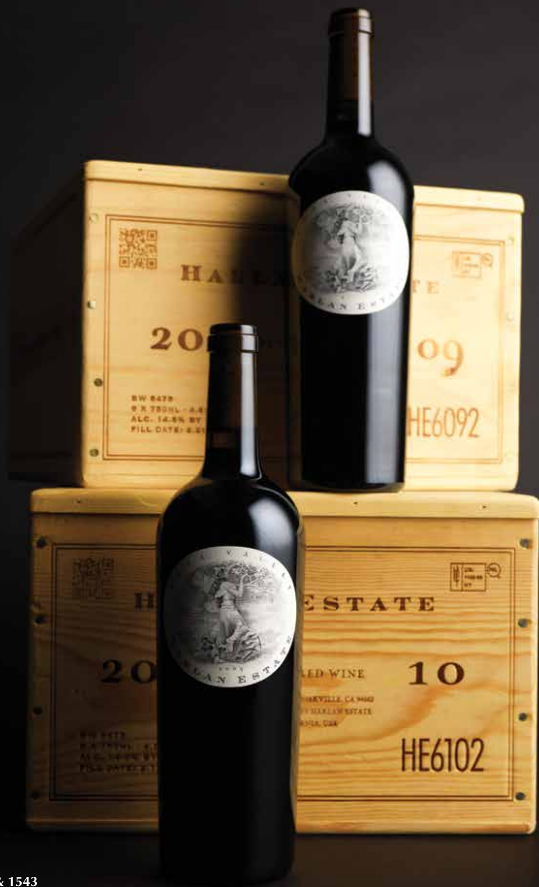
Lots 1542 & 1543