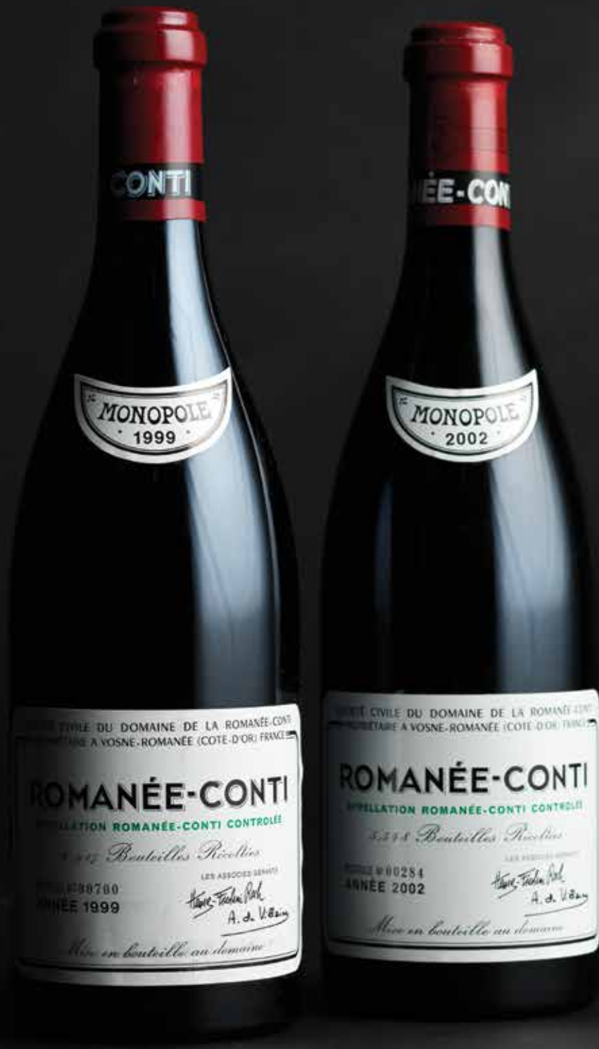
Lots 1302 & 1305