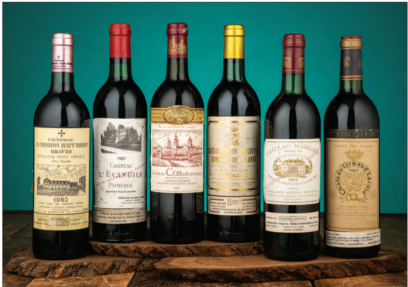
Lots 1921, 1923, 1925, 1931, 1932, 1935