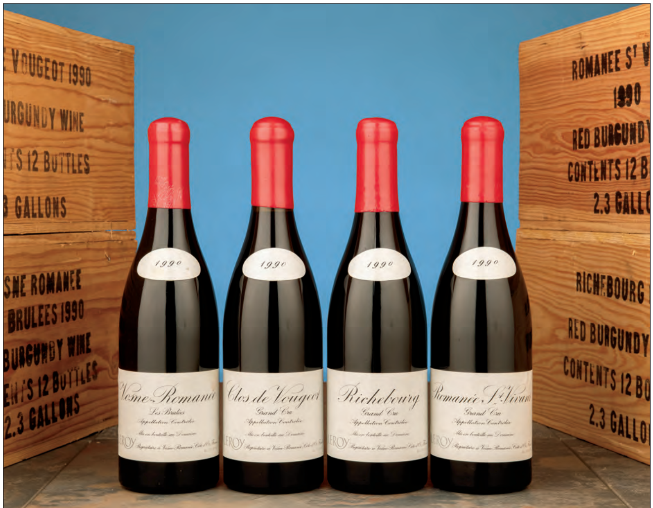
Lots 3096, 3098, 3099, 3101

3098 10 bottles (owc) per lot $30000-45000