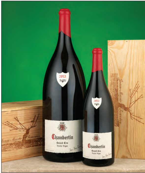
Lots 3623, 3624