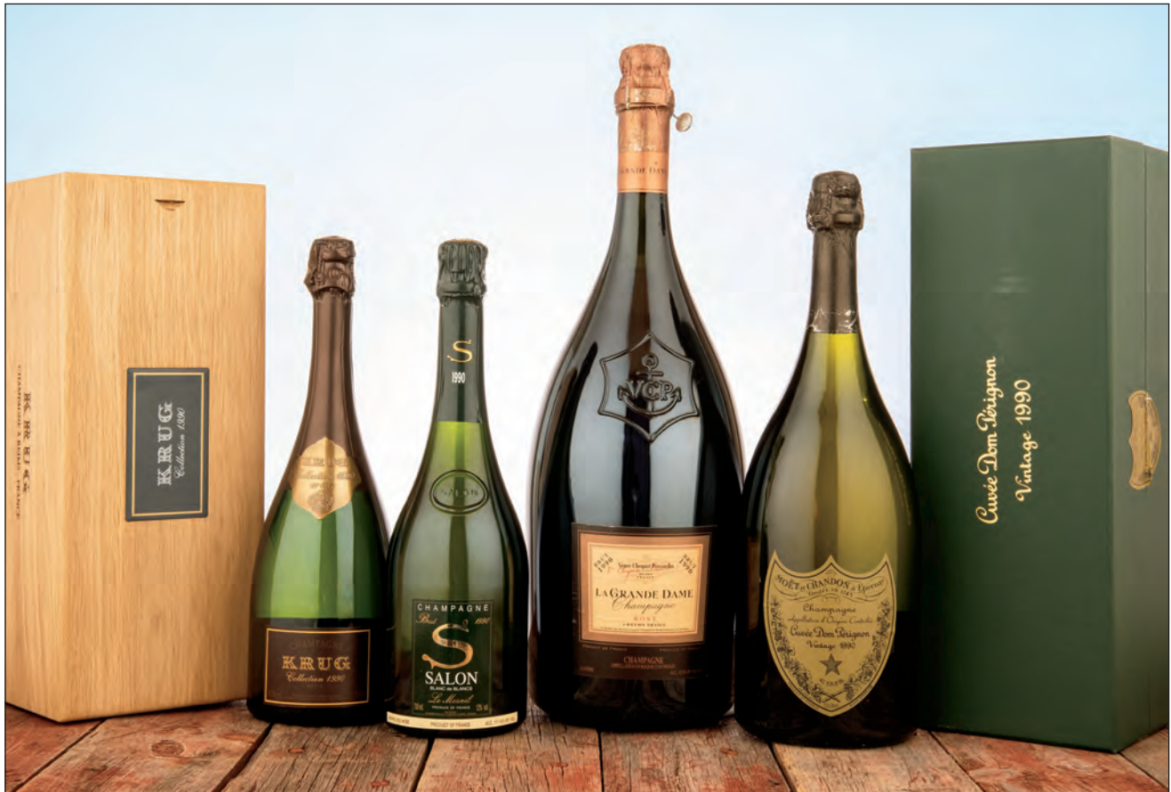
Lots 606, 610, 626, 635