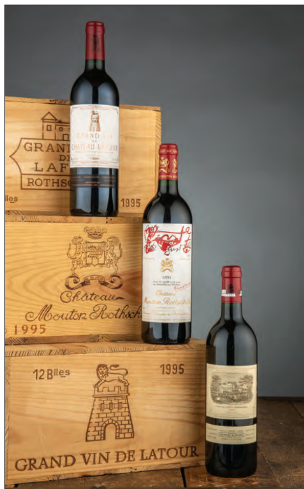
Lots 1218, 1219, 1224

1219 12 bottles (owc) per lot $4200-6500