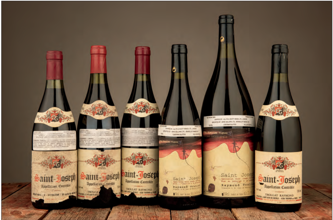
Lots 3059, 3061-3064