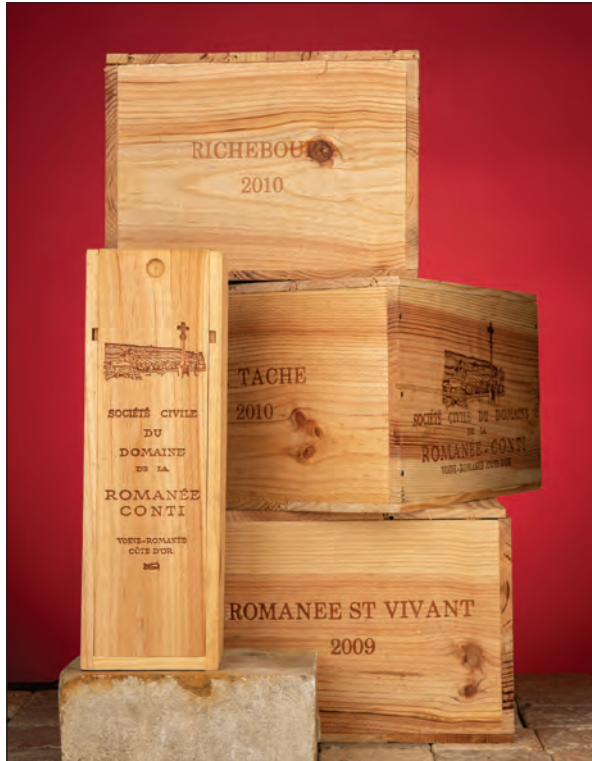
Lots 2773, 2784, 2796, 2818

2796 6 bottles (owc) per lot $12000-18000