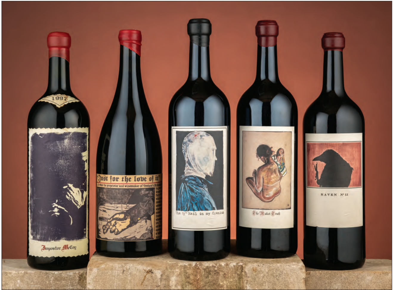
Lots 1123, 1130, 1141-1143