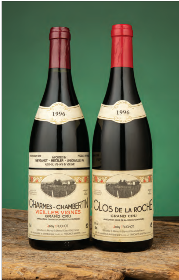
Lots 1886, 1887